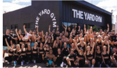
THE YARD GYM