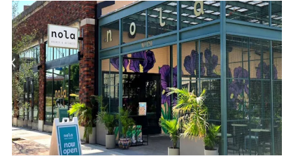
NOLA BRUNCH & BEIGNETS