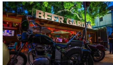
BURLESON YARD BEER GARDEN